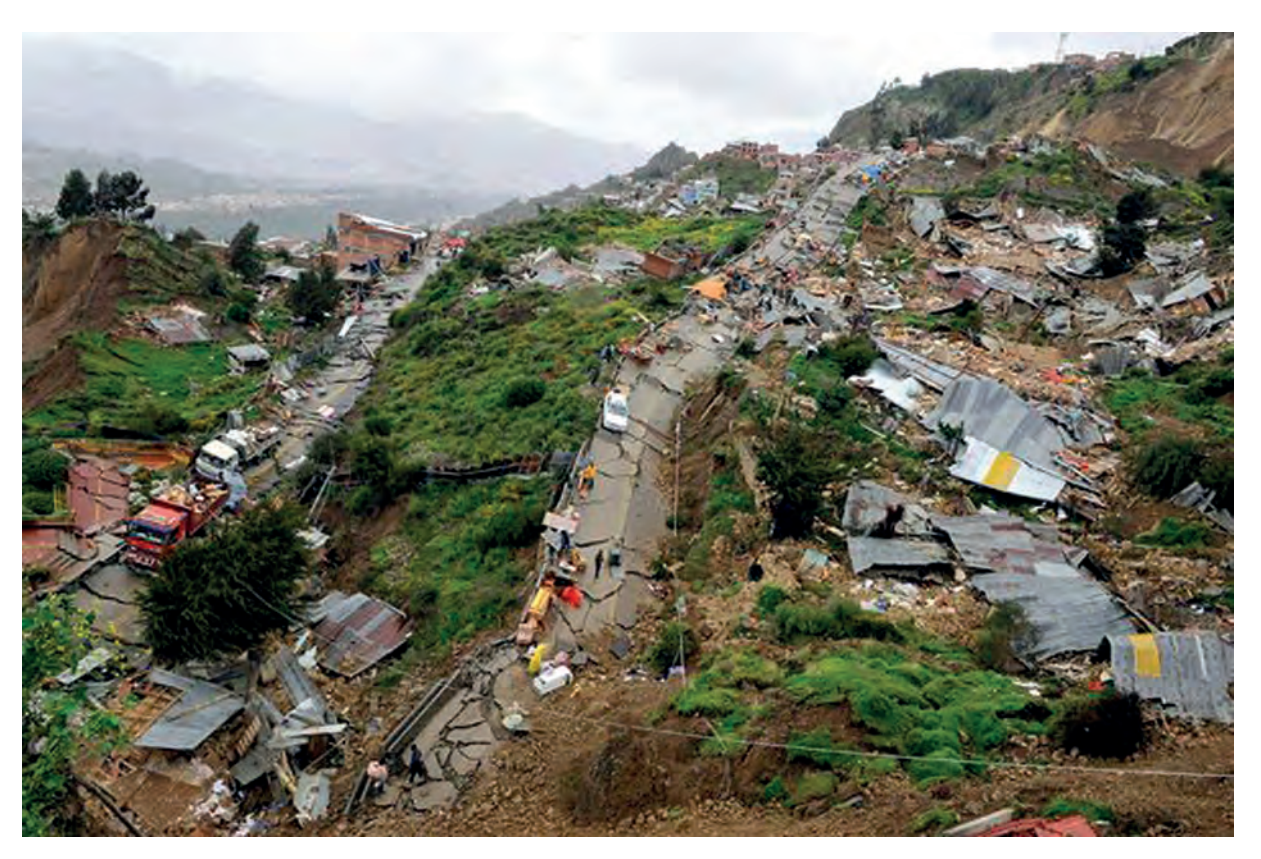
Fig. 2 for Question 7